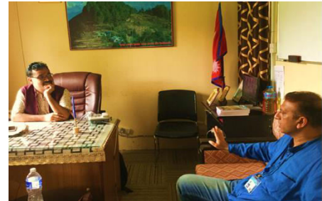
Meeting with Plauntar Municipality Mayor