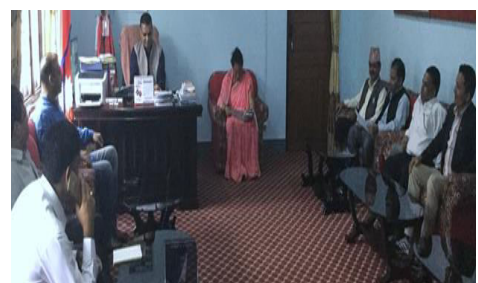
Meeting with Municipality Team

In addition, prior to the induction programme, together with UNDP Gorkha Office the team from UNDP Country Office organized several meetings with the district authorities including Municipal leadership and its key officials. These interaction meetings were found quite productive for the smooth implementation of the projects as well as supported to the Local Government to get full ownership and other coordination support from the local administration to complete the projects on timely manner.